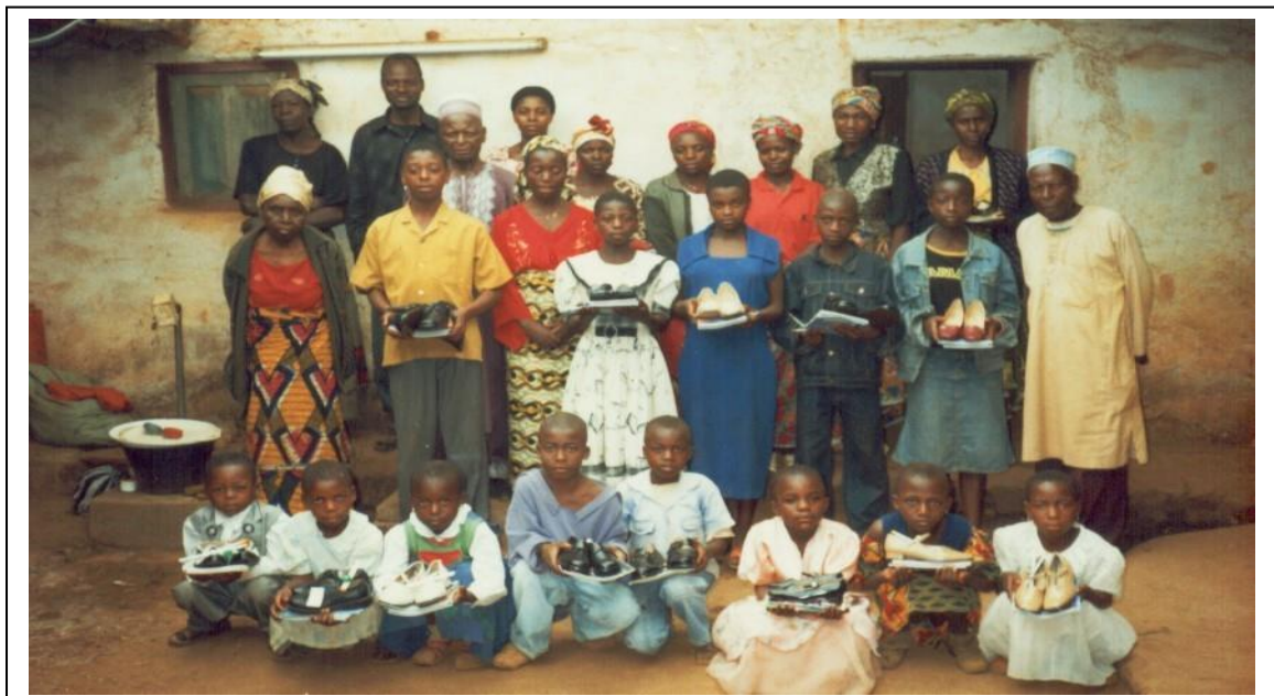
13 orphans of the FORCE CAM Community Support Programme receiving shoes, exercise books, etc