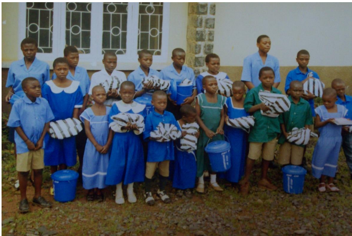
Orphans in their various schools uniforms, books and materials collected on 8 September 2007.

Within the framework of a collaboration agreement signed with AIDS Waisen International in Germany, FORCE-CAM implemented an AIDS Orphans programme which entailed the provision of Educational needs comprising the provision of school fees, school uniforms and books/materials; livelihood care comprising the provision of food, medical care, clothing and general home needs; and activities to distract and educate the children socially. During the year under review, the programme supported 23 AIDS Orphans and their families comprehensively.