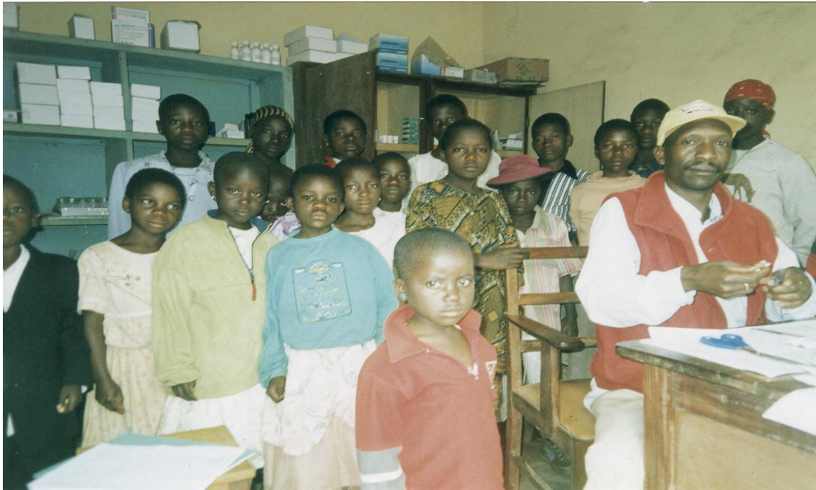
Orphans receiving medication after consultation at the Ndu Distric Health Centre